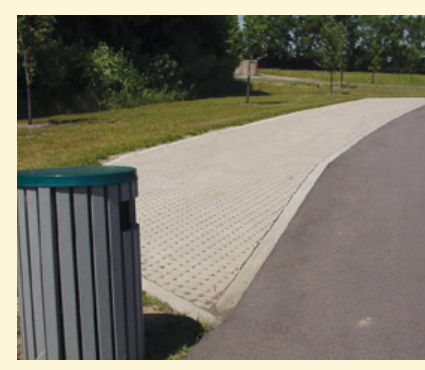
Completed parking area