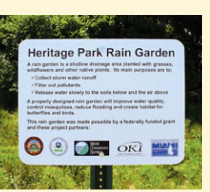
The Heritage Park Rain Garden Project in Hamilton County is a good example of multi-government and communitybased organizations working together to implement water runoff solutions.