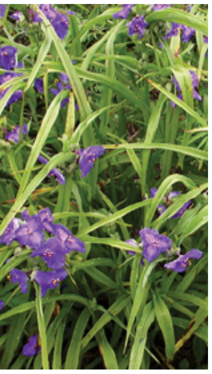
Twenty-seven species of native grasses and spring-flowering perennials were planted around the pervious parking lot and in the rain garden, providing an important habitat for animals, and a burst of spring color for park visitors.

The pervious parking area cost $16,500 for labor and materials, excluding curbs and excavation-$12.70 per square foot (approximately). The rain garden cost approximately $15,000 excluding donated labor and materials.