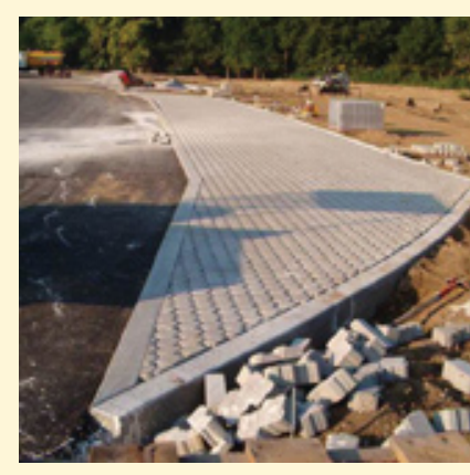
Pervious brick pavers are installed to allow runoff to seep into the ground.